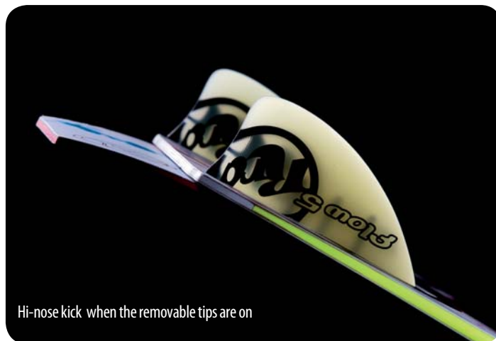
Hi-nose kick when the removable tips are on