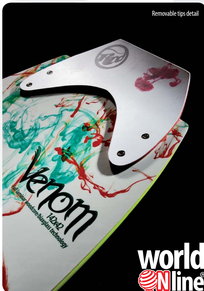
Removable tips detail