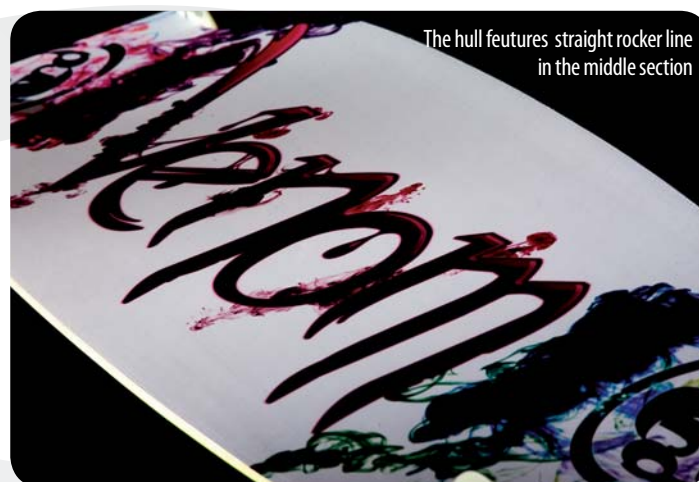
The hull features straight rocker line in the middle section