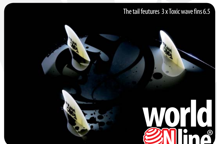
The tail features 3 x Toxic wave fins 6.5