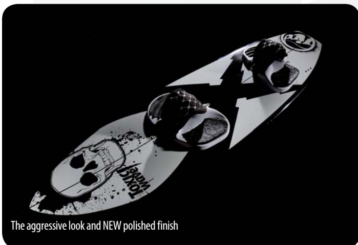
The aggressive look and NEW polished finish