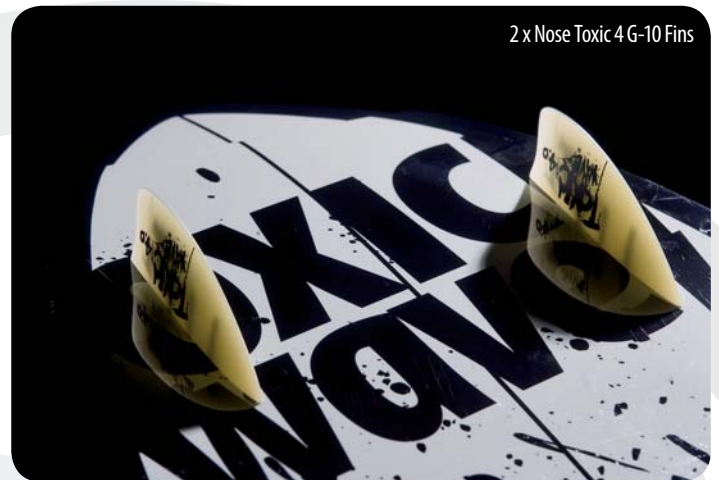
2 x Nose Toxic 4 G-10 Fins