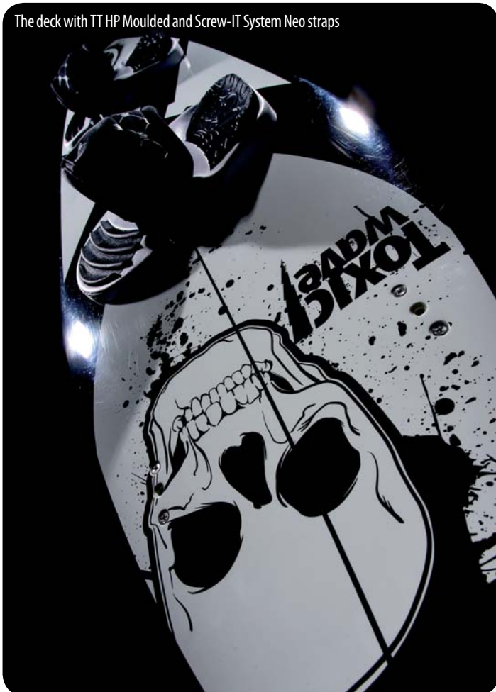
The deck with TT HP Moulded and Screw-IT System Neo straps